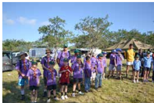
3rd Newcastle Cubs and Scouts looking good in their Scout shirts.